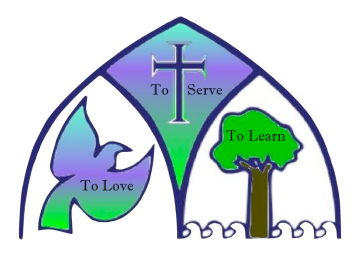
St. Francis Xavier Catholic School.